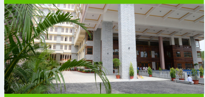
Research Forum 17th August 2023

The speaker emphasized the pivotal role of Articles 15, 16, and 21. Drawing attention to the issue of remuneration, the speaker underscored the existing wage gap between female employees and their male counterparts at similar employment levels. The discourse further illuminated potential research avenues, centering around unequal pay, gender-based disparities in leadership roles, and the involvement of women in upper-tier management and decision-making processes.